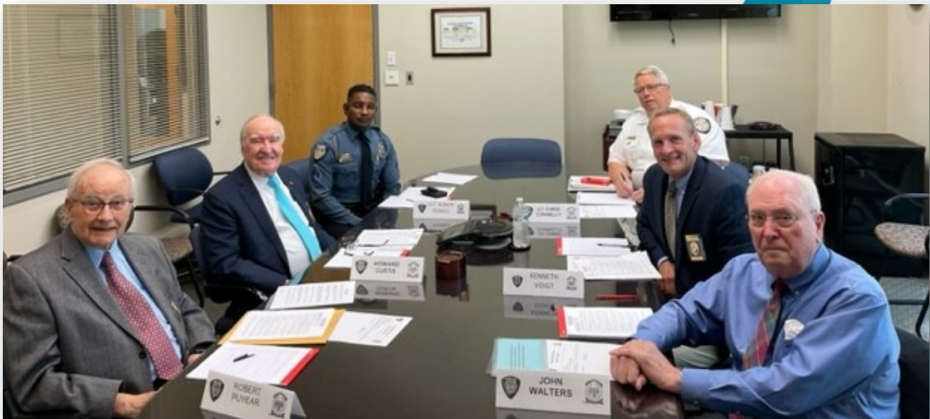
The Police Personnel Board preparing for Oral Interviews with police candidates.